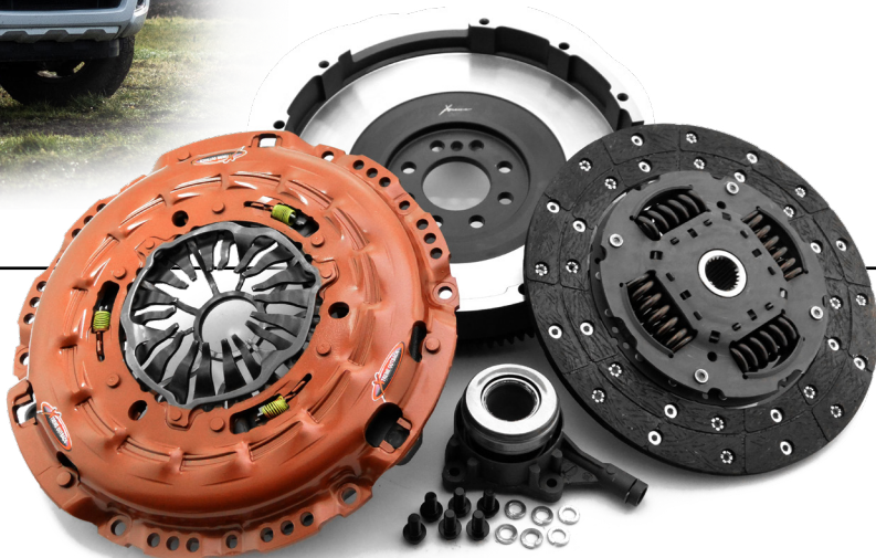
Kit Pictured: KFD27612-1A

The Ford Ranger is proving to be one of the most popular dual cabs in today's market and with a large number of aftermarket upgrades available for these vehicles, they commonly require a clutch upgrade to suit. Xtreme Outback heavy-duty clutch kits are a popular upgrade for these vehicles due to excellent driveability and performance.