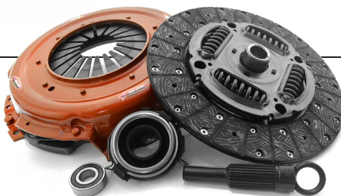
Kit Pictured: K1Z28009-1A

The Isuzu D-Max offers a tough off-road platform, ideal for tradespeople and off-road enthusiasts alike. Xtreme Outback have been supplying a wide range of different clutch options for years and have tested the kits in some of the toughest rallies on the planet. Xtreme Outback have now added the 1.9L variant to the range including standard replacement and 2 heavy duty upgrades.