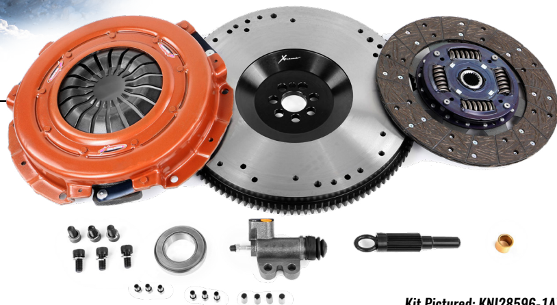
Kit Pictured: KNI28596-1AX

The Xtreme Outback heavy duty upgrades for 4x4 & SUV offer an unrivalled level of quality, performance and reliability. Xtreme Outback performance applications for the TD42 has been developed to cater for all levels of driving. Rigorously tested, in the harshest conditions on the planet, you can trust the Xtreme Outback clutch to take you anywhere.